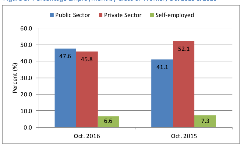
Figure 3: Percentage Employment by Class of Worker, Oct 2015 & 2016

Figure 3 presents changes in the distribution of employed persons by class of worker. The proportion of private sector employment and self-employment has declined compared to October 2015.