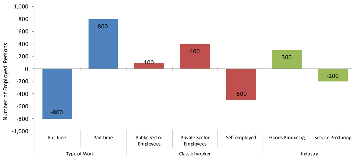
Figure 2: Changes in the number of employed persons from previous year

On a year-over-year basis, there has been a shift away from full time employment into part-time employment. Similarly, gains in private and public sector employment were offset by a decline in self-employment. In December 2015, there were 200 fewer people working in the service producing industry, while employment increased by 300 people in the goods producing industry.